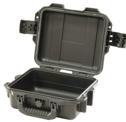
iM2050-X0000 No Foam