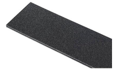
1500TPDIV Extra TrekPak Dividers