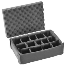
iM2200-DIV Padded Divider Set