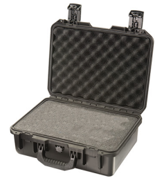
iM2200-X0001 With Foam