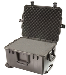
iM2750-X0001 With Foam