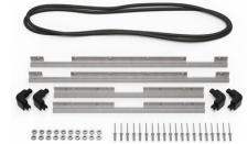
iM2750-M4-BEZEL-L Lid Bezel Kit (Metric)