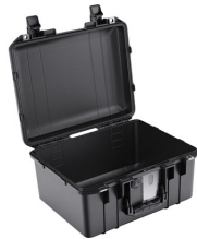
1507NF No Foam