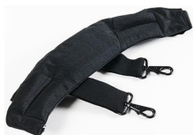
1432 Strap Kit