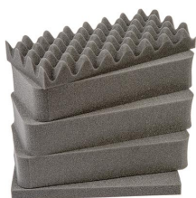
1431 5 pc. Replacement Foam Set