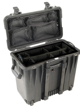
1444 With Utility Padded Divider Set & Lid Organizer