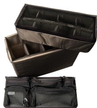
1445 Utility Padded Divider Set & Lid Organizer