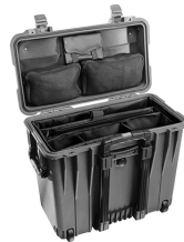
1447 With Padded Office Divider Set & Lid Organizer