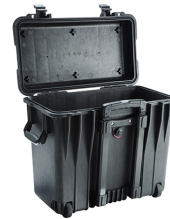
1440NF No Foam