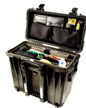
1446 Office Divider Set & Lid Organizer