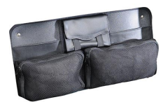
1449 Office Lid Organizer