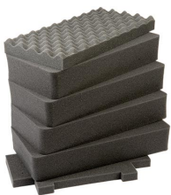
1441 6 pc. Replacement Foam Set