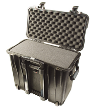
1440WF With Foam