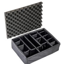
1525 Padded Divider Set