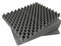
1521 3 pc. Replacement Foam Set