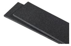
1525TPDIV Extra TrekPak Dividers