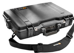
1495NF No Foam