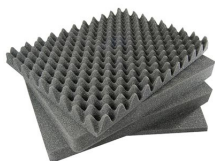
1771 4 pc. Replacement Foam Set