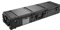
1770NF No Foam