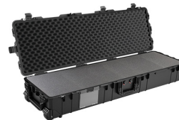
1770WF With Foam