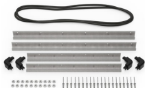
iM2700-M4-BEZEL Base Bezel Kit (Metric)