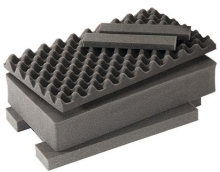
1535AirFS 3 pc. Replacement Foam Set