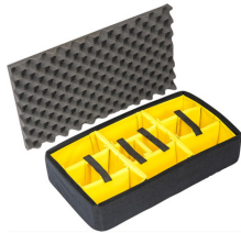
1555AirDS Padded Divider Set