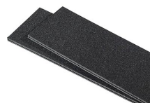
1525TPDIV Extra TrekPak Dividers