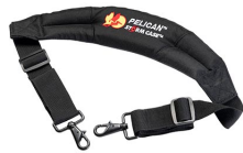
iM2370-STRAP-S Removal Padded Shoulder Strap