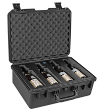
WHISKY-MULTIB Quad Whiskey