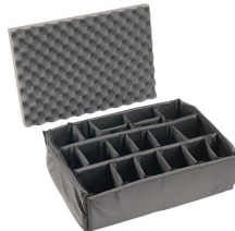
iM2600-DIV Padded Divider Set