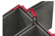
iM2600-TREK TrekPak Case Divider Kit