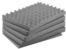
iM2600-FOAM 5 pc. Replacement Foam Set