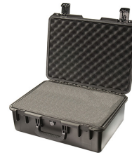
iM2600-X0001 With Foam