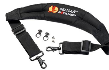
iM-STRAP-S-VER2 Padded Shoulder Strap