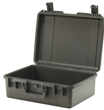
iM2600-X0000 No Foam