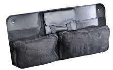
1449 Office Lid Organizer