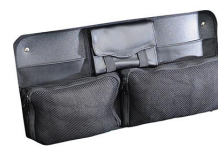
1449 Office Lid Organizer