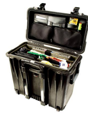
1446 Office Divider Set & Lid Organizer