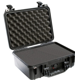
1450WF With Foam