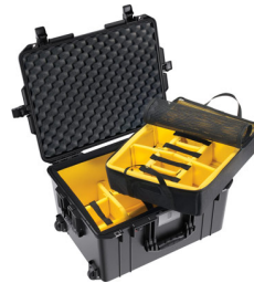
1607WD With Padded Dividers