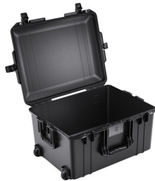
1607NF No Foam