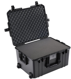
1607WF With Foam