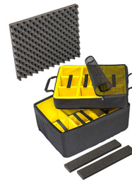
1607AirDS Padded Divider Set