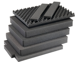
1607AirFS 3 pc. Replacement Foam Set