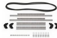
iM2450-M4-BEZEL-L Lid Bezel Kit (Metric)