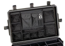
iM29XX-UTILITYORG Utility Organizer