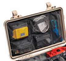
1519 Lid Organizer