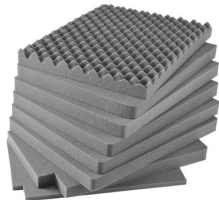
iM2750-FOAM 7 pc. Replacement Foam Set