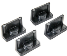
1507 Quick Mounts - set of 4