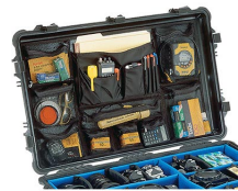
1659 Photo/Lid Organizer