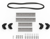
iM20XX-M4-BEZEL Base Bezel Kit (Metric)