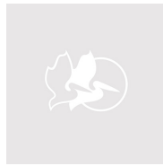
iM2975-X0002 With Padded Dividers