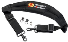
iM-STRAP-S-VER2 Padded Shoulder Strap