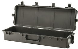
iM3220-X0000 No Foam