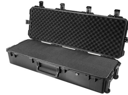
iM3220-X0001 With Foam