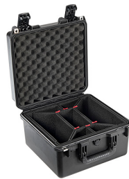
iM2275-X0006 With TrekPak Divider System