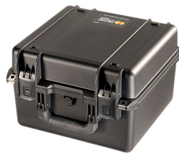
iM2275-X0000 No Foam