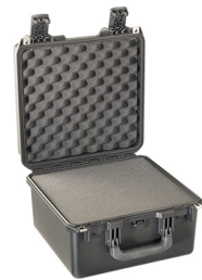
iM2275-X0001 With Foam