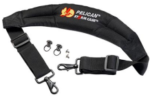
iM-STRAP-S-VER2 Padded Shoulder Strap