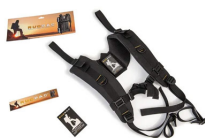
RucPac-normal RucPac Standard Hardcase Backpack Conversion

c/ Provença, 388, Planta 7 • Barcelona, Spain 08025 • Phone: +34 934 674 999 info@peli.com • www.peli.com