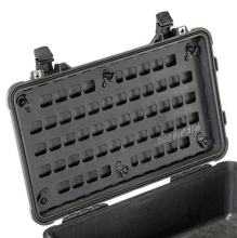
1510MP EZ-Click™ MOLLE Panel