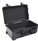
1510NF No Foam