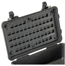
1510MP EZ-Click™ MOLLE Panel