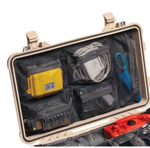
1519 Lid Organizer