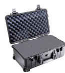
1510WF With Foam