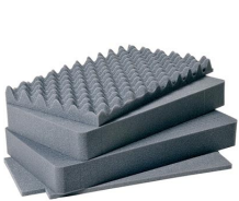
1511 4 pc. Replacement Foam Set