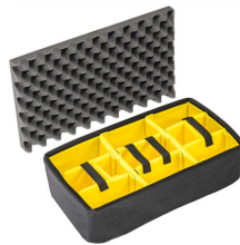
1515 Padded Divider Set