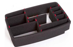
1510EUTP TrekPak Case Divider Kit