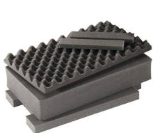
1535AirFS 3 pc. Replacement Foam Set