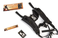
RucPac-normal RucPac Standard Hardcase Backpack Conversion