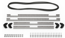
iM2700-M4-BEZEL-L Lid Bezel Kit (Metric)