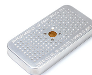
1500D Desiccant Silica Gel