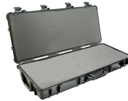
1700WF With Foam