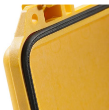
1703 Replacement O-ring