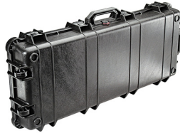
1700NF No Foam